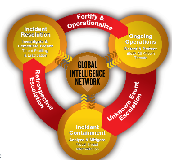
Figure 2: An Advanced Threat Protection Lifecycle defense, with selected Blue Coat products